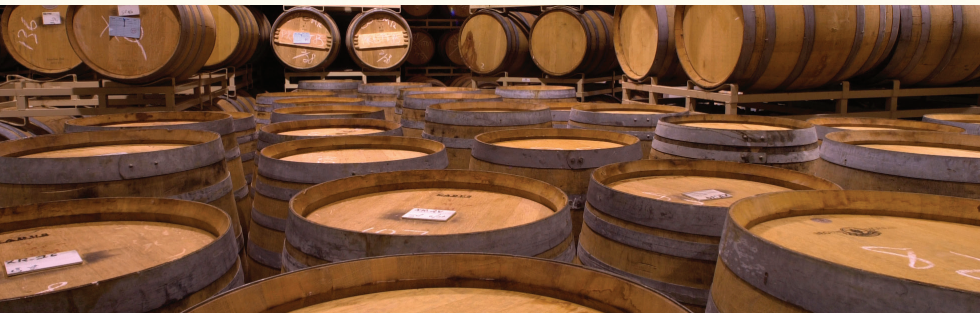
Oak barrels in J. Lohr's Paso Robles facility

Enjoy with a glass of J. Lohr Estates Los Osos Merlot!