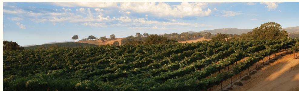
J. Lohr's Merlot Vineyards, Paso Robles

Have a preset gas grill on high or prepare a charcoal grill and roast the ribs for 5 to 10 minutes rotating all the sides until browned. Meanwhile, strain the cooking juices into a saucepan, pressing the vegetables to extract all the liquid. Skim off and discard the fat. Bring to a boil and let the mixture simmer to reduce it so it thickens slightly. Taste for seasoning and add more salt and pepper if needed. On a large platter, arrange the short ribs on top and spoon the cooking juices over them. Serve with mashed potatoes, your favorite vegetables and a glass of J. Lohr Estates Los Osos Merlot.