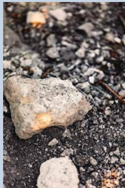
The limestone-calcareous soils of Beck Vineyard.

When describing J. Lohr's approach to each tier, Peck explains that the winery's "goals are the same, but the tools [it uses] to execute on them are a little different." And while all three wines share similar traits, they're each characterized by grape sourcing and cellar techniques. Read on for a full breakdown of each of J. Lohr's Cabernet Sauvignon-based tiers: