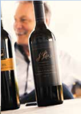
J. Lohr 2014 Signature Cabernet Sauvignon ($100) Concentrated and juicy black fruit with notes of caraway and anise. The luxurious, supple mouthfeel builds into plush tannins for a richer attack on the finish. —Michelle Ball

To ensure it's drinkable upon release, the wine is aged in 100 percent new French oak for 17 months and bottled for nearly two years. "In a way, it's a 'Hilltop Reserve' in that it's a superlative experience in the current release," Peck says. "It's also a wine that would certainly hold with age, but it's not a wine you have to cellar long-term to get the most out of it."