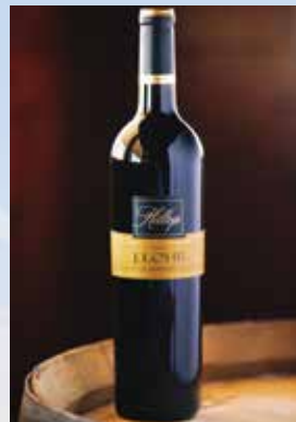
J. Lohr 2015 Hilltop Cabernet Sauvignon ($35) Savory, brambly fruit with minty undertones that speak to the vintage. Dense mid-palate concentration with subtle, well-integrated oak characteristics. Aged in 75% new French oak for 18 months. —M.B.

Specific vineyard blocks are slated as possible components for Hilltop, yet Peck says J. Lohr doesn't want to pass up new opportunities, either. After fermentation, Peck "barrels down" roughly 75,000 cases—nearly five times more than he needs—into French oak barrels, and over the next few months, the winemaking team tastes through each of the barrel lots to whittle it down to roughly 15,000 cases. "You already have to meet a really high threshold to be a part of those 75,000 cases, then we pull the best of the best to make the Hilltop blend," Peck says. The remaining wine is then added to the Seven Oaks Cabernet, thereby elevating the final blend of J. Lohr's popular, entry-level wine.