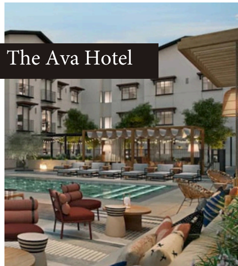
The Ava Hotel

In the heart of downtown Paso Robles, The Ava Hotel is the newest luxury property that offers a modern retreat in California wine country.