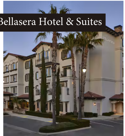
Bellasera Hotel & Suites

Upscale, contemporary hotel and restaurant featuring oversized suites just a few minutes from downtown Paso Robles.