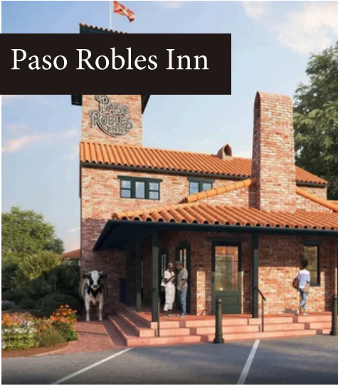
Paso Robles Inn

A historic stay in the heart of downtown Paso Robles, offering charming accommodations, on-site dining, and easy access to local wineries and shops.